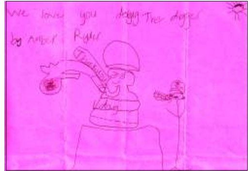
Amber from Dargaville sent in this lovely illustration