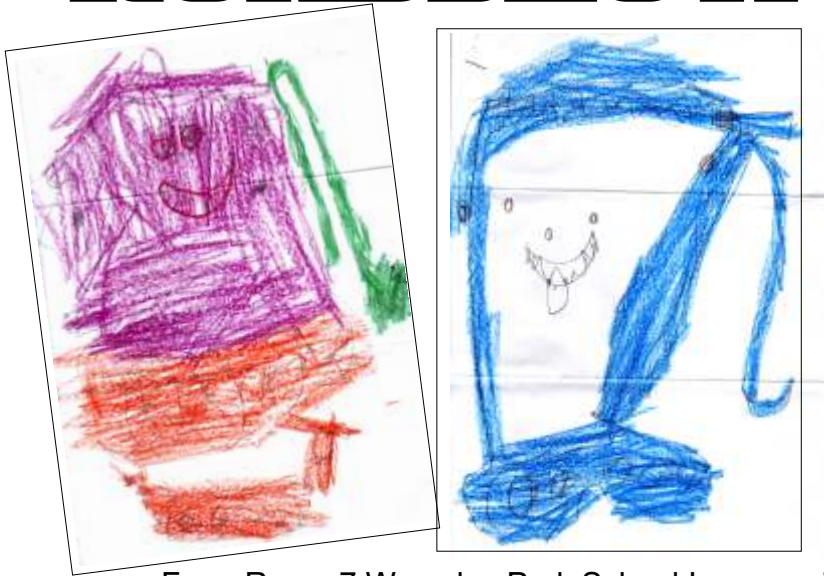
From Room 7 Waverley Park School Invercargill

Many thanks for all the many wonderful letters and drawings from budding young writers and artists from all over New Zealand. Keep up the fantastic work